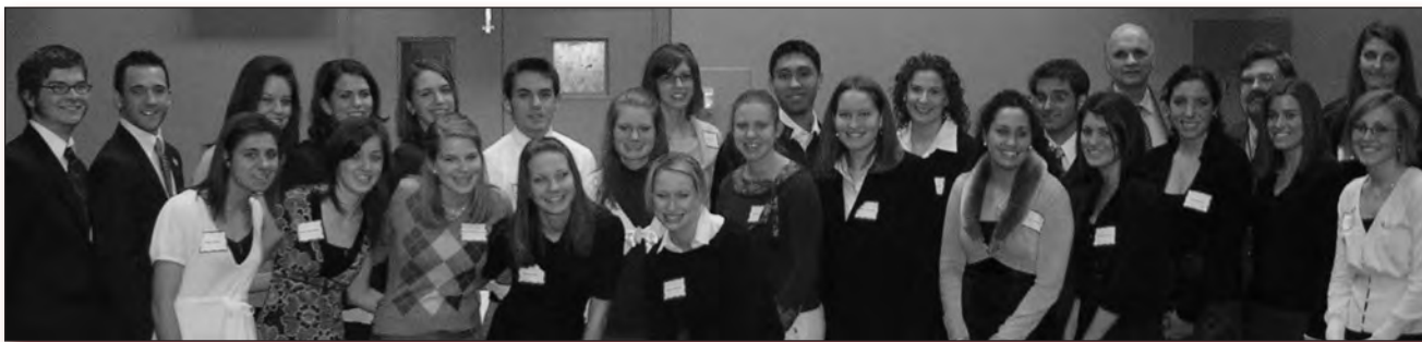
New Alpha Sigma Nu inductees at St. Joseph's University pose for a group photo.

Canisius: Held Chapter retreat with the focus on what it means to be Jesuit, the significance of attending a Jesuit School, and the continued importance of upholding Jesuit values post graduation.